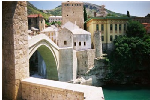
Destroyed in 1993 during the war in Bosnia and Herzegovina, the Old Bridge of Mostar was rebuilt 11 years later. It is a reconciliation symbol.

UNESCO is dedicated to promoting better understanding of the proactive role of cultural heritage, cultural diversity and human creativity as a basis for dialogue and reconciliation and a vehicle for peace-building, social stability, respect for human rights, and disaster reduction. In addition to provide international coordination mechanisms and enhance the application of normative tools for the protection of