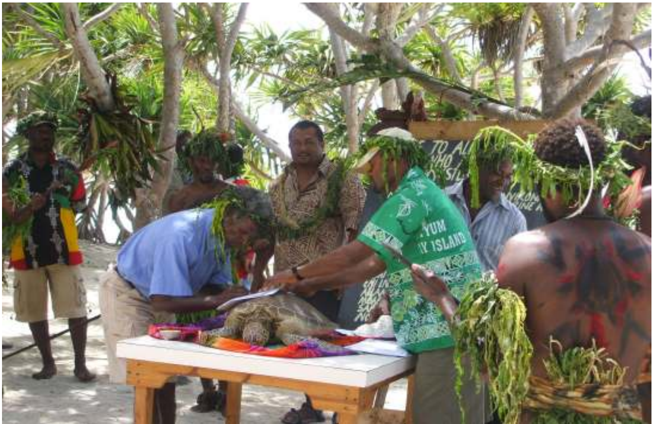
Signing of Annelcauhat waste management plan. 19 th November 2007