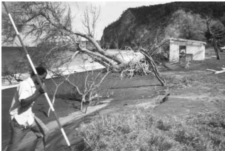
Photo 7. Foxes Bay, Montserrat, one month after Hurricane Lenny. December 1999.

The beach-monitoring database was used by the Physical Planning Unit during the period 1992–1995, when a programme was established to stop the mining of beach sand at all beaches except Farms Bay, and to use quarry sand for all construction purposes except the final plastering/finishing of buildings. 6 However, due to the