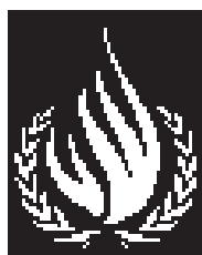
United Nations Commission for Human Rights