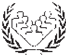
United Nations Volunteers