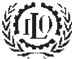
International Labour Organisation