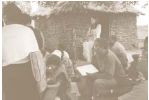
Talking with members of the community

In another session, participants were asked to work in groups and act out scenes about different people in different types of relationships, for example, a doctor diagnosing an HIV-positive status, work colleagues, spouses, in-laws, bosses and community members. After the groups acted out the scenes, the entire Workshop scrutinized them one by one thereby bringing out the complex net of human relationships that