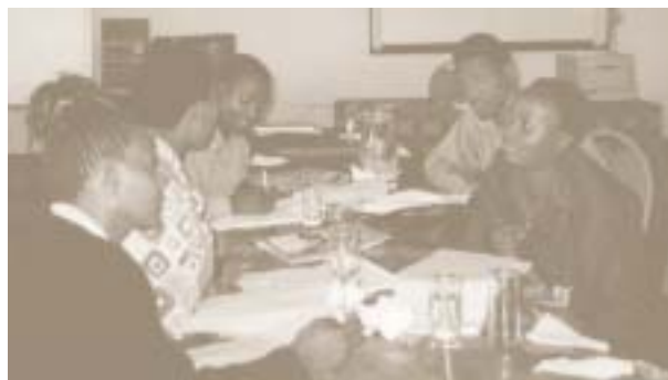
Men and women taking an active part in discussing social and cultural issues such as bride price, wife inheritance and status of women within the family

Along similar lines, euphemisms for AIDS also exacerbate the denial problem. "It is called 'slim' in Kenya as people living with it lose a lot of weight", said Therese Lesikel of WHO. But talking around HIV/AIDS does nothing to alleviate the situation. The workshop provided an ideal setting for bringing these subjects out of the shadows. The message, as UNAIDS' Bernadette Olowo-Freers puts it, "is to face one's HIV status and learn to live with it positively. Infected people can live for 10 years or even more." Her colleague, Tcebile, who was among workshop participants, is living proof of