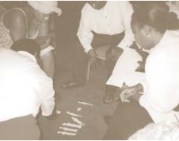
Practical exercises on the social impact of HIV/AIDS

In yet another session, participants again organized themselves into groups and were given a few cut out paper figures of human beings. They were then asked to place each one within a family relationship. Each group