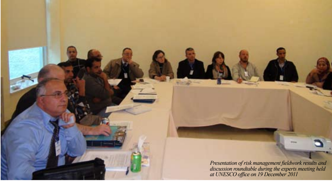
Presentation of risk management fieldwork results and discussion roundtable during the experts meeting held at UNESCO office on 19 December 2011