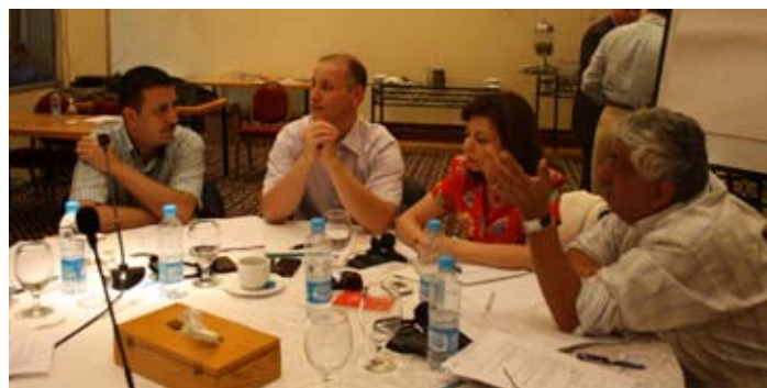
Group Discussions among participants in the Media Self-Regulation Retreat

Earlier in the year, UNESCO had provided international expertise to the Government of Jordan by providing an assessment of the media situation in the country following UNESCO's Media Development Indicators (MDI). One of the recommendations of the MDI assessment was the establishment of an independent self-regulatory media body that regulates issues related to professionalism and ethics of journalists in Jordan. A second workshop is scheduled for early next year to plan for further action towards the realisation of media self-regulation in Jordan.