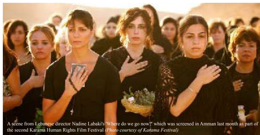
A scene from Lebanese director Nadine Labaki's 'Where do we go now?' which was screened in Amman last month as part of the second Karama Human Rights Film Festival