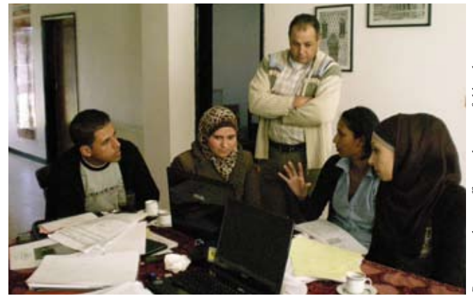
Discussion during office work among fieldwork team members in the assessment of risks at the Turkamania Tomb

The methodology will be updated and reviewed based on the fieldwork experience and comments raised during the experts meeting. Once finalized, The Risk Management Methodology for the Petra Archaeological Park will serve as a tailored tool to identify risks for the site, assess their impact on heritage and to help site managers to prioritize the decision making for the better management of the site.