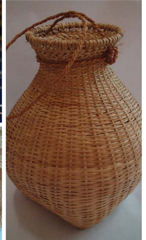
Kuoy basket made from rattan