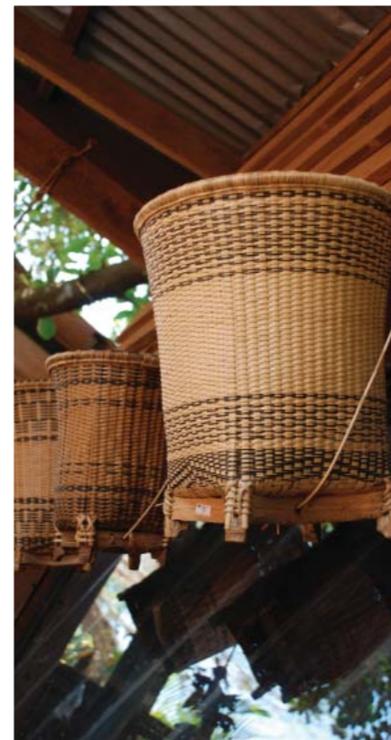
Backpack baskets (Kapha) made by Phnong Indigenous Artisans