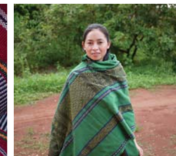
Textile made in Mondulkiri