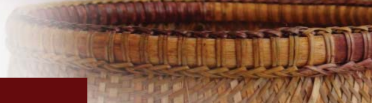
Rice baskets used for crops, and for storing small items, made from bamboo