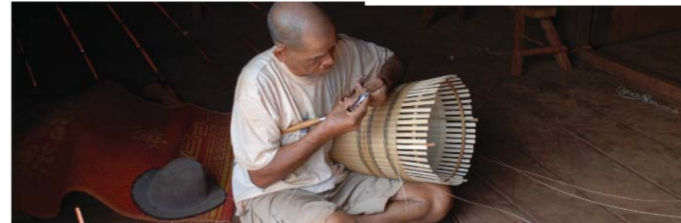
An artisan making backpack basket (Kapha) in La In Chamka, Konmom district, Ratanakiri province