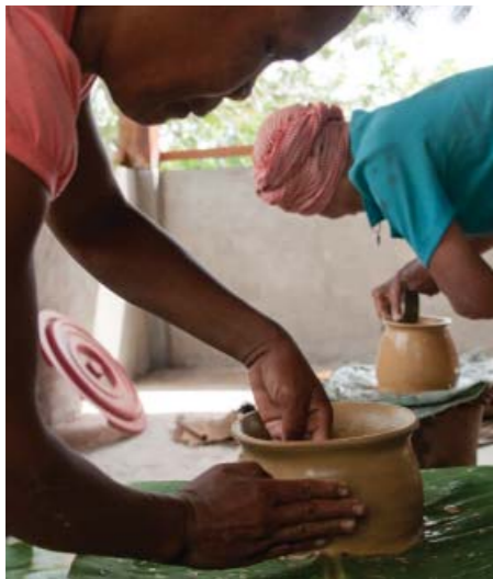
Traditional ceramic-making techniques in Konmom, Ratanakiri