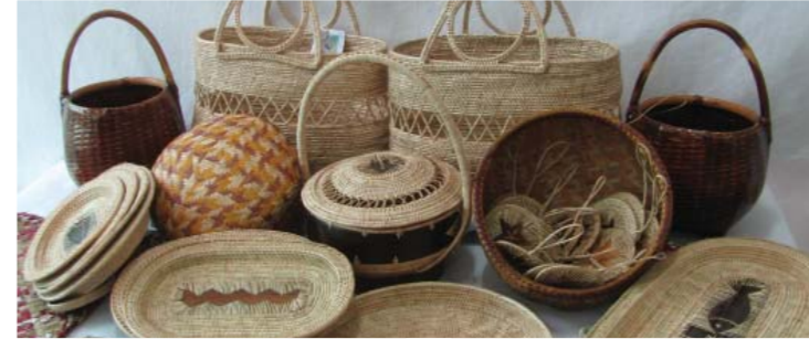
Products made from rattan and bamboo