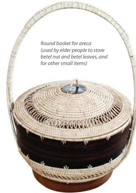
Round basket for areca (used by elder people to store betel nut and betel leaves, and for other small items)