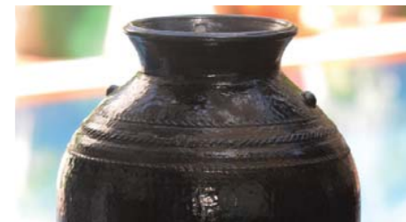
Pottery made of special clay in Ratanakiri