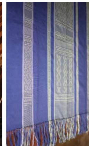
Textiles with natural dye