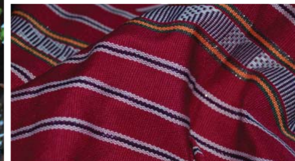
Textile made in Mondulkiri