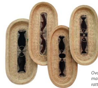
Oval platters made from rattan

Sixty producers living in Vensai and Konmom districts, Ratanakiri province, are making Jars and pottery (home accessories and decoration products). They are unique types of products because they are made of special clay collected from the Sesan river banks. The combination of indigenous traditions and new designs add value to the products while reflecting the traditional livelihood of Ratanakiri populations. To order the products, please contact CEDAC or directly with the producers.