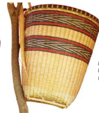
Indigenous backpack basket (Kapha)