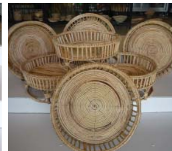
Fruit baskets made from rattan