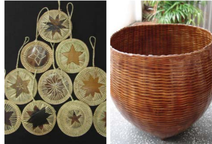
Christmas gifts and decorations