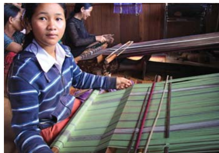
A young textile artisan in Mondulakiri

Indigenous People represent 1.4 percent of the total population in Cambodia, and the majority of them are living in remote rural areas within the country. Often referred to as Highlanders, their ways of life are different from the lowlanders, both from the cultural and economical perspective.