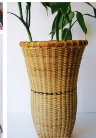
Decorated basket lamp made from bamboo