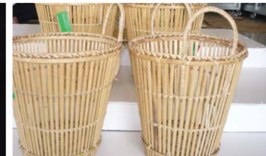
Waste paper or laundry baskets, made from bamboo