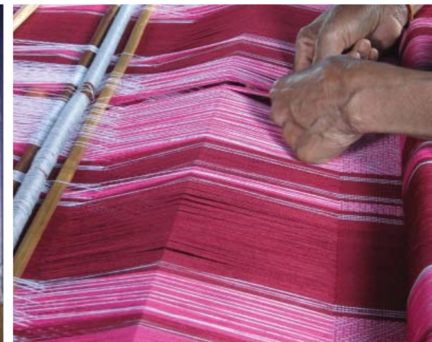
Indigenous loom and textile weaving in Mondulkiri