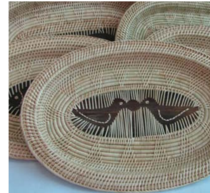
Oval platters made from rattan