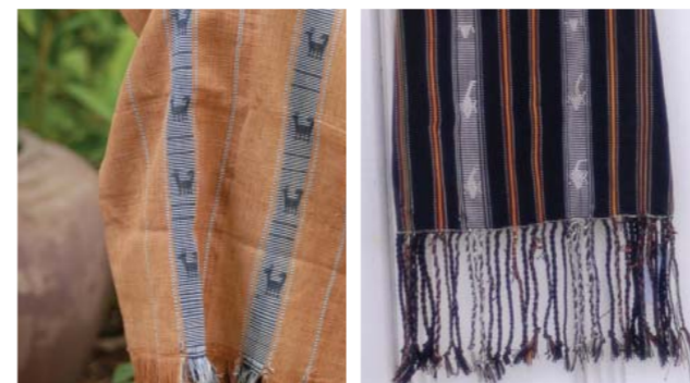
Scarves with natural dye