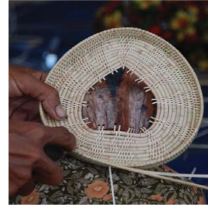
Lotus platter made from rattan