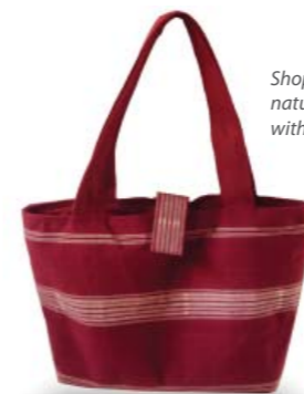
Shopping bags: natural-dyed cotton with long handle