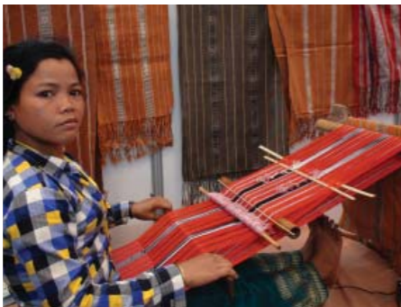
Textile weaving shown at fair trade exhibitions.

The Creative Industries Support Programme (CISP) is a joint programme between the International Labor Organization (ILO), the Food and Agriculture Organization (FAO), the United Nations Educational, Scientific and Cultural Organization (UNESCO), and the United Nations Development Programme (UNDP) in partnership with four ministry counterparts of the Royal Government of Cambodia, and funded by the UN-Spain Millennium Development Goals Achievement Fund (MDG-F).