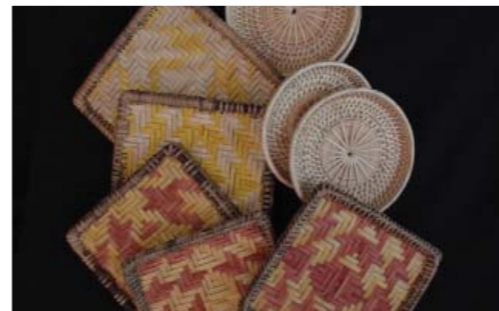
Coasters made from bamboo & rattan, using natural dyes