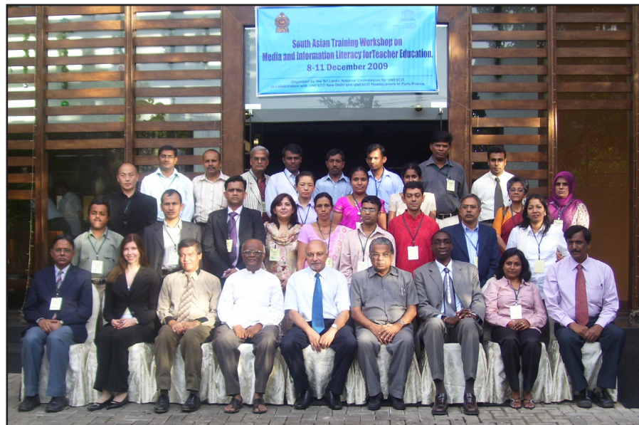
South Asian Training Workshop on Media and Information Literacy for Teacher Education

The background of participants and balanced geographical representation ensured that a wide variety of perspectives were brought to the working process.