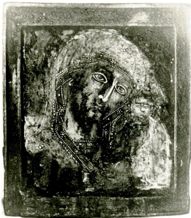
Virgin Mary of Kykkos