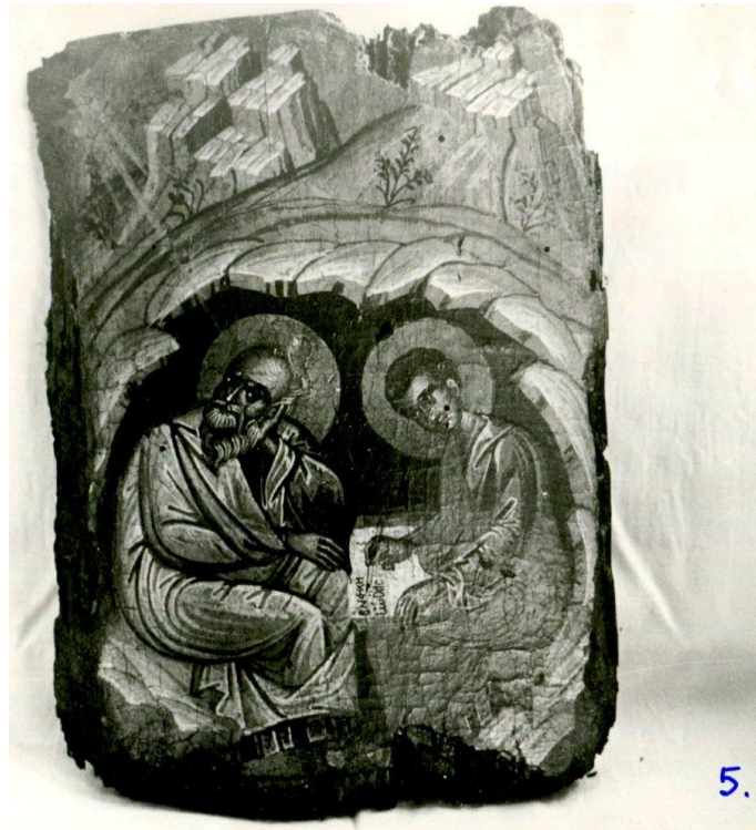
Saint John Theologos with Saint Prochorus