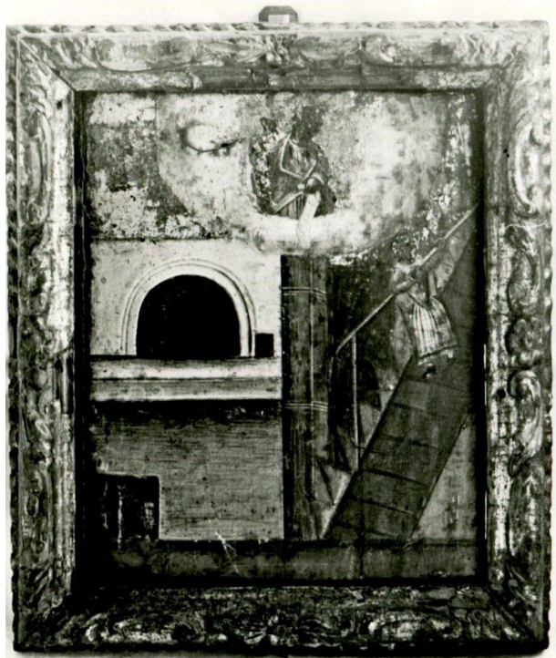
Virgin Mary the Climax