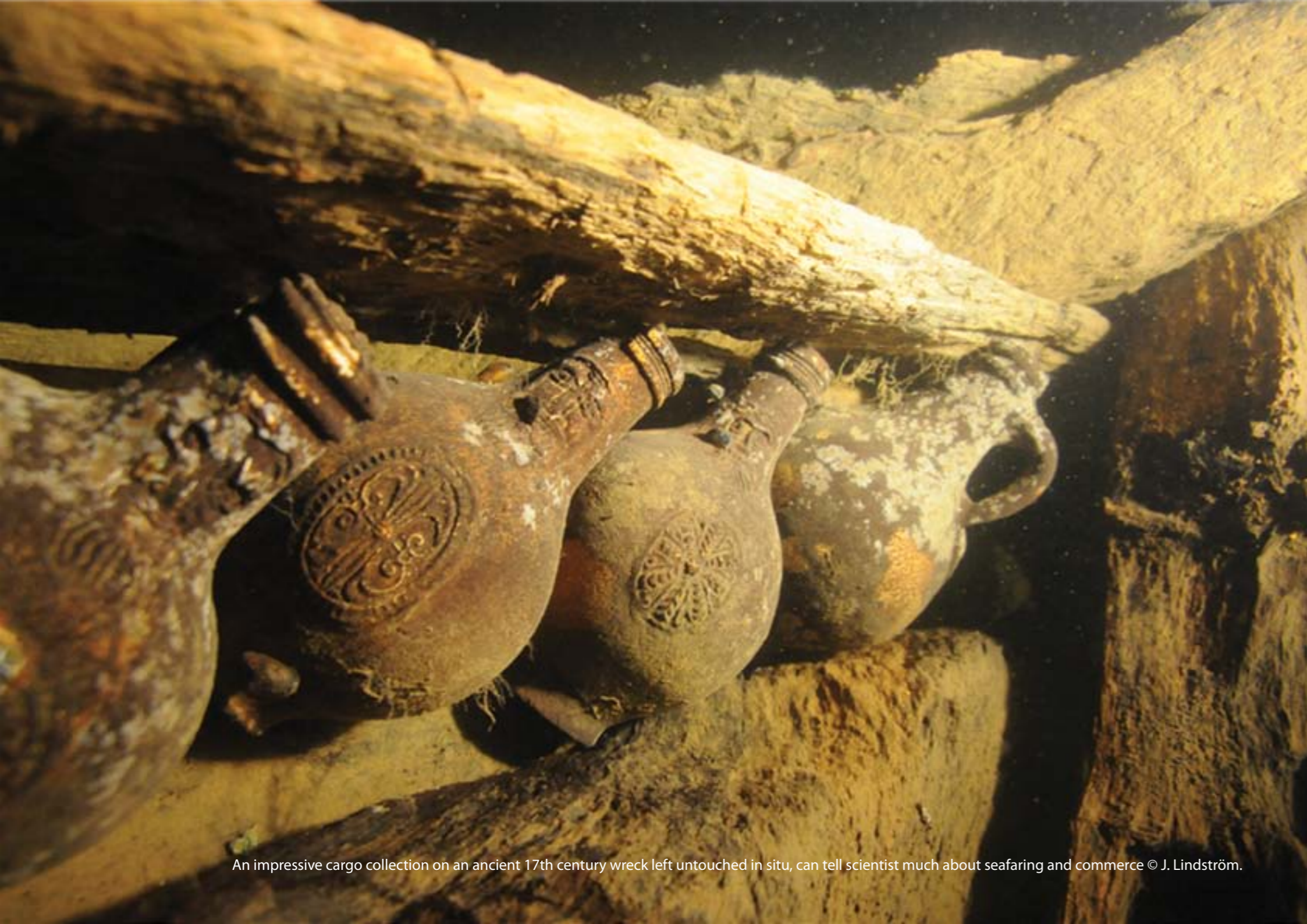
An impressive cargo collection on an ancient 17th century wreck left untouched in situ, can tell scientist much about seafaring and commerce