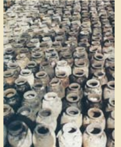
Pillaged and confiscated objects in Thailand

“The ocean is the largest museum of the world” Salomon Reinach (1928)