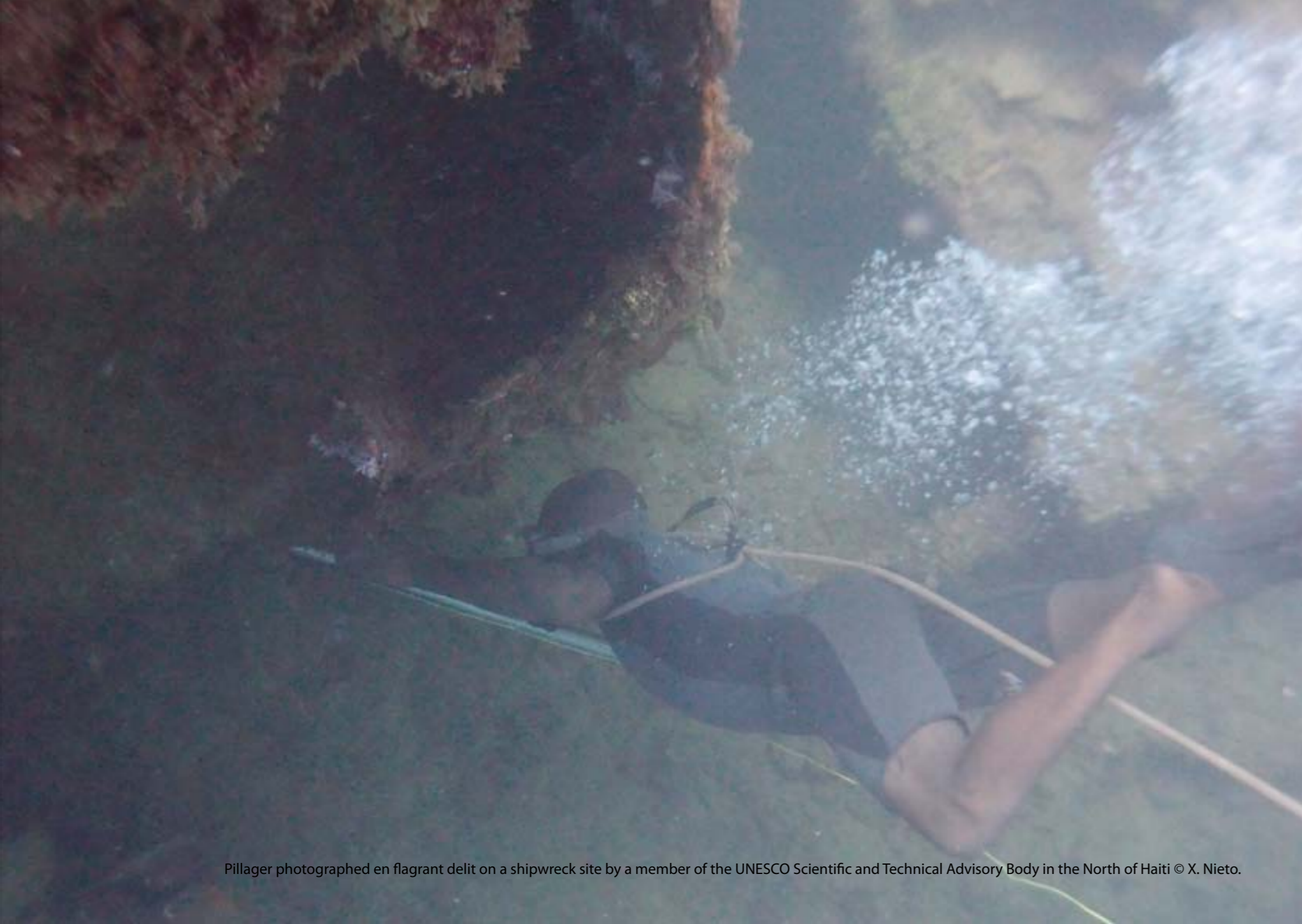
Pillager photographed en flagrant delit on a shipwreck site by a member of the UNESCO Scientific and Technical Advisory Body in the North of Haiti