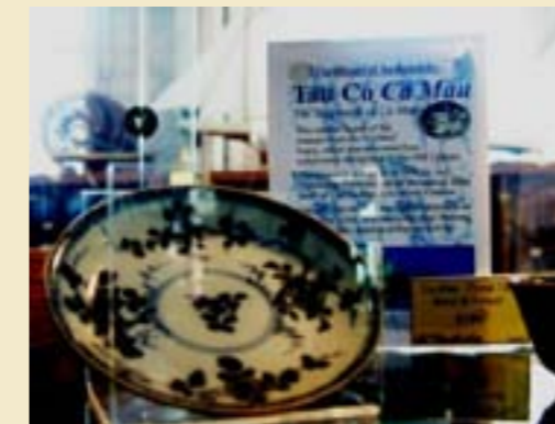
Vietnamese Tau Co Ca Mau artefacts, commercially salvaged from an ancient wreck, available for sale in the United Kingdom

Commercial exploitation operations regularly violate scientific standards of archaeological excavations, as they focus on the recovery of valuable materials. Conservation and documentation rules are generally not respected. In addition, commercial exploitation operations are often accompanied by investment fraud.