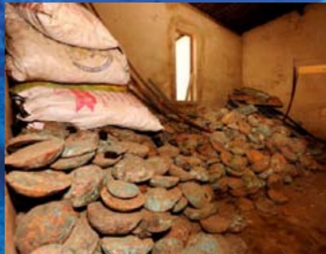
Copper ingots stolen from the Sao Idefonso in Madagascar. This wreck, a testament to the history of early Portuguese seafaring, was completely destroyed by looters.