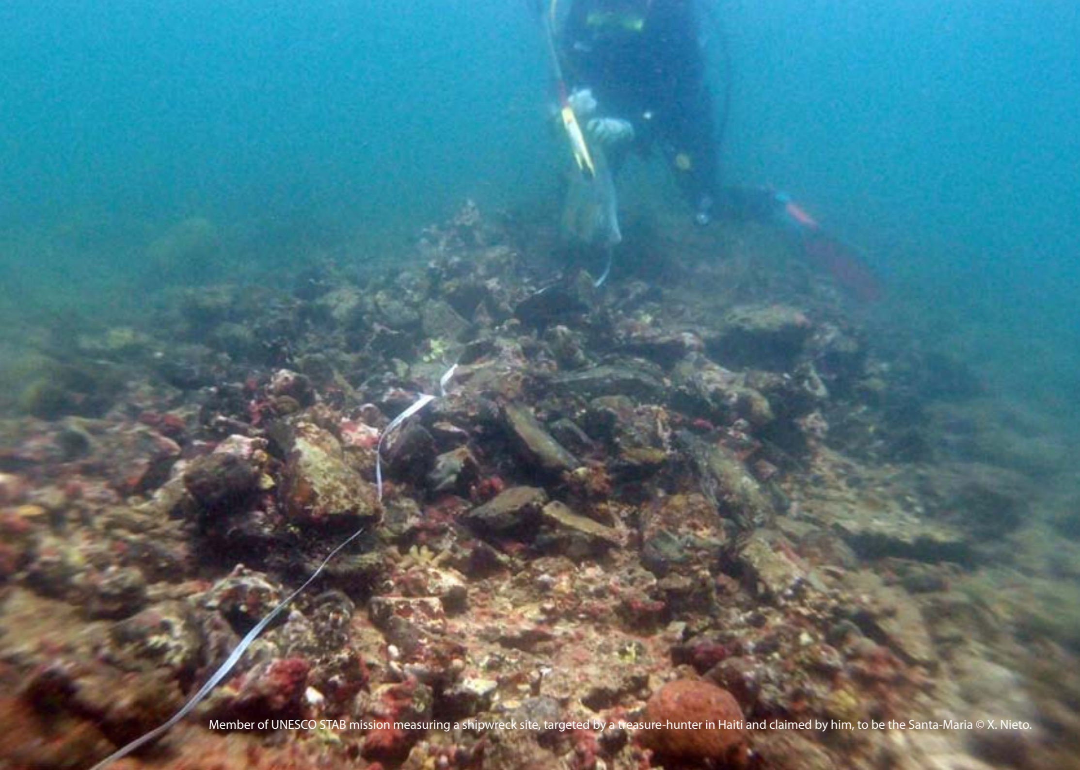
Member of UNESCO STAB mission measuring a shipwreck site, targeted by a treasure-hunter in Haiti and claimed by him, to be the Santa-Maria