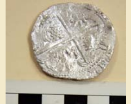
A silver coin from the Panamanian San José damaged due to excessive electrolysis © X. Nieto.