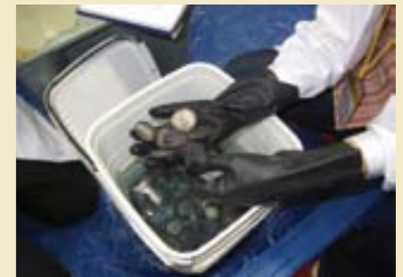
Pillaged Mercedes wreck coins © Ministry of Education, Culture and Sport, Spain.

The actual value of the cargo did not exceed 13 million USD, not including costs related to equipment, boats and staff expenses, as well as conservation treatments, the latter being left mainly unattended to by the salvors. The real value of the wreck could have only been “recovered” if its scientific value had been carefully researched.