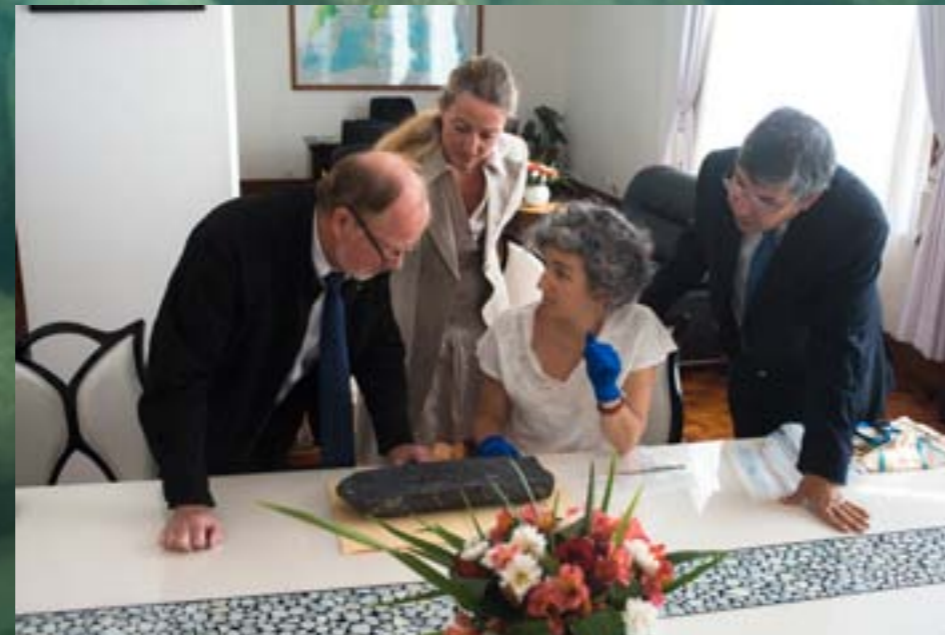
UNESCO Scientific and Technical Advisory Body mission in Madagascar.

The STAB can intervene in a timely and low-cost manner, as demonstrated by the STAB's recent assistance missions. 4