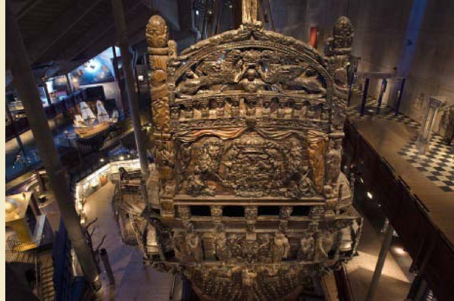
The Swedish Vasa Museum