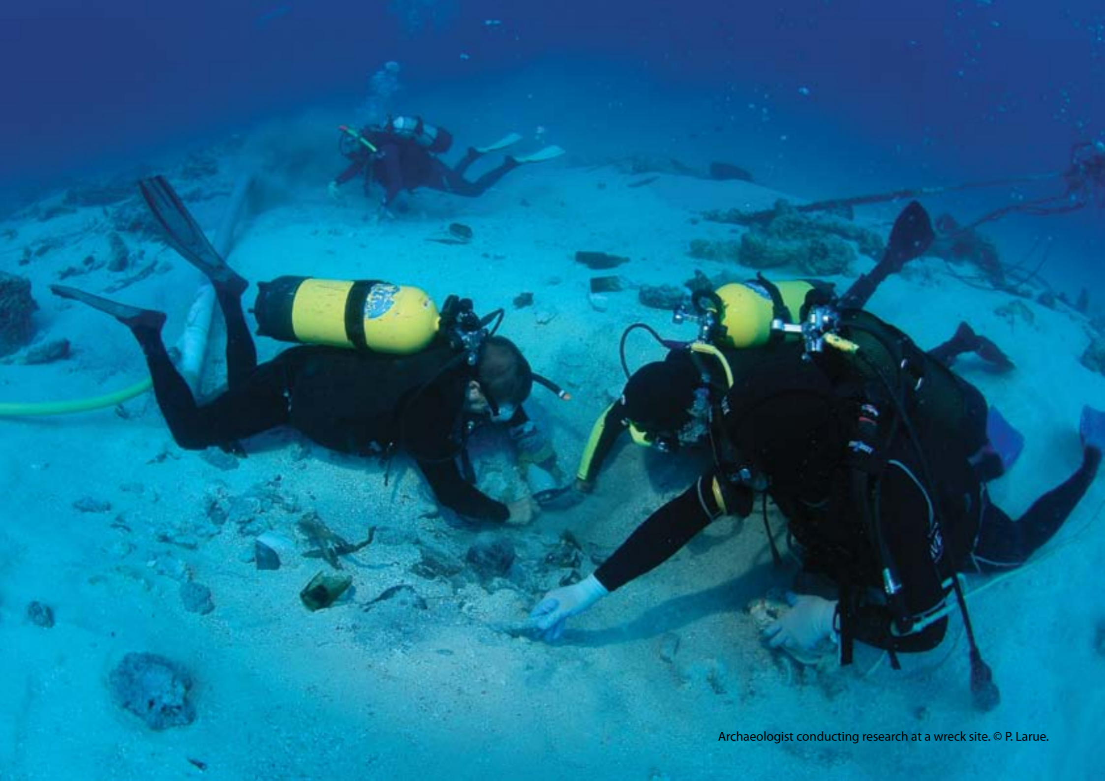
Archaeologist conducting research at a wreck site.