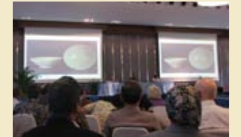
Artefacts from the Cirebon wreck and picture of auction in Jakarta.

In April 2004 the 10th century Cirebon wreck was exploited by a private Belgian company, which raised some 500.000 pieces of the cargo, throwing however half of the artefacts back into the ocean to destroy them, as these were judged not sellable for a good price, demanding too much conservation and – if left on site – nevertheless sellable by local pillagers in competition to the salvage firm.