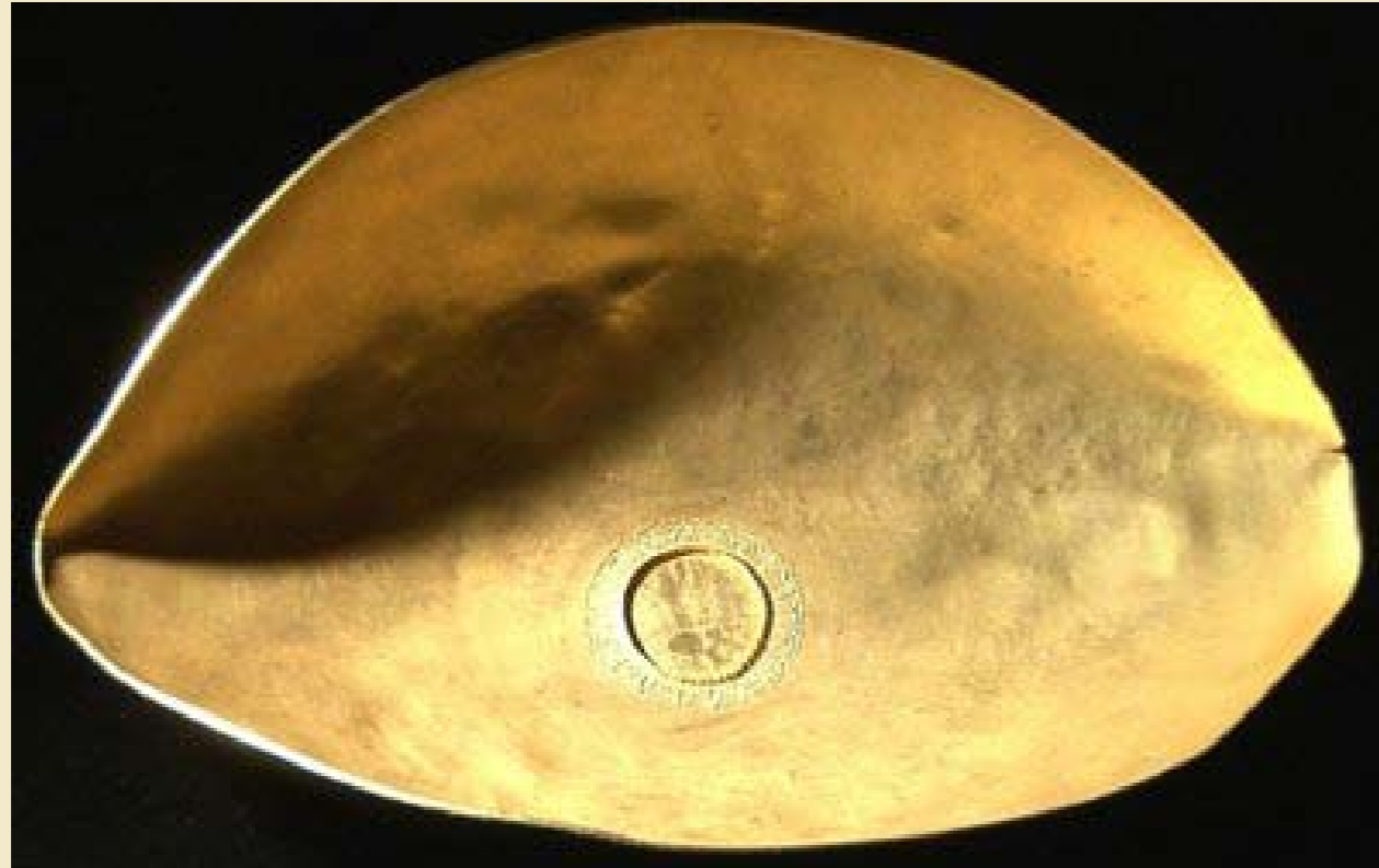
The French Lava Treasure –A Looted Roman gold plate found under water.

Looting also desecrates grave sites, which are common to many wrecks. For instance, wreck sites from the Battle of Jutland in World War I have recently been stripped of metal and artefacts for financial reward.