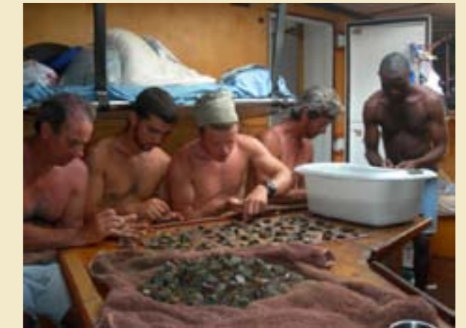
Treasure hunters counting coins from a wreck site in Africa (Arqueonautas S.A., a treasure hunter firm, website screenshot).