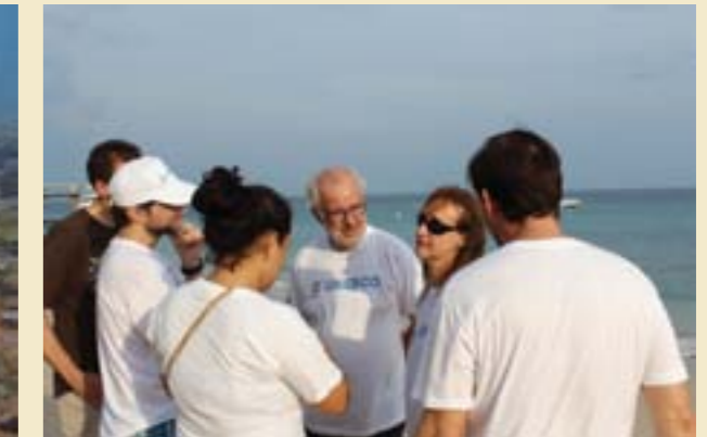
Members of the Scientific and Technical Advisory Body during an assistance-mission