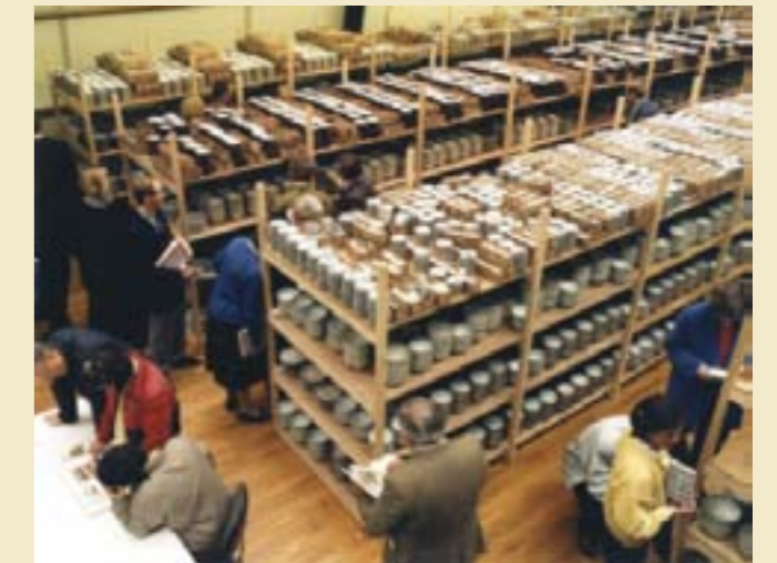
Sale of the Geldermahlsen artefacts in Amsterdam

Document elaborated by the Secretariat of the UNESCO Convention on the Protection of the Underwater Cultural Heritage (2001)