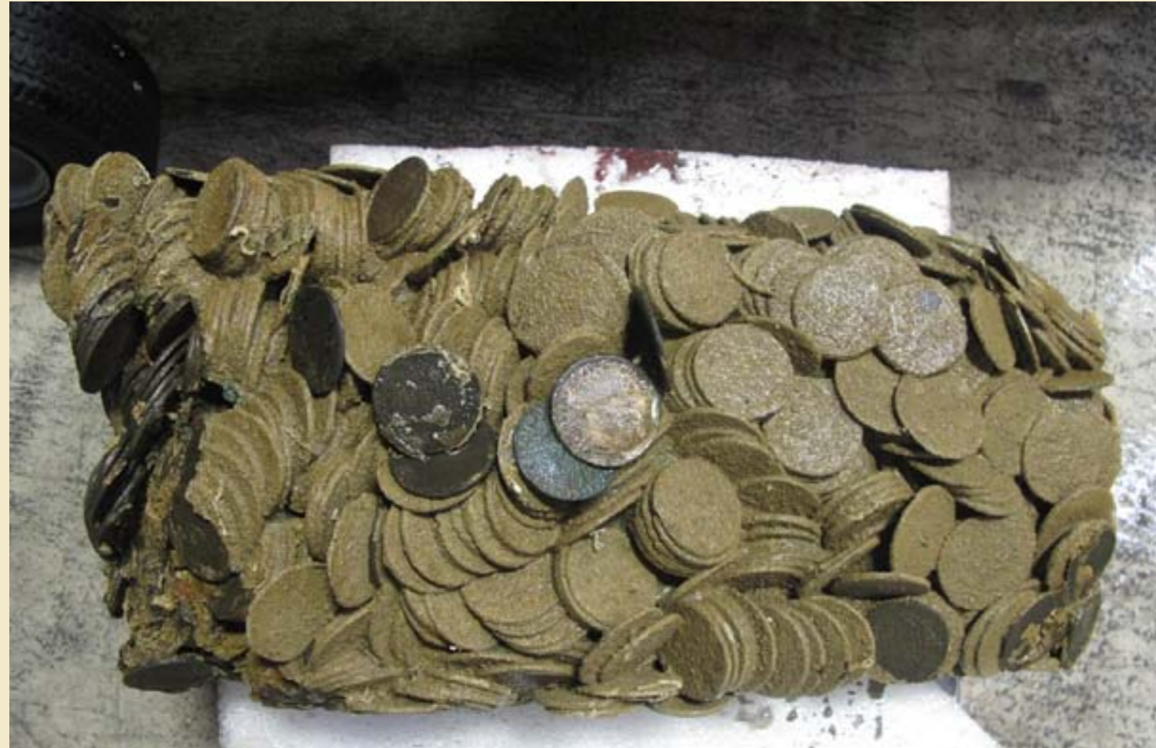
Coins from the Nuestra Señora de las Mercedes, which preserve the form of the trunk they were in when the ship sank © Ministry of Culture, Spain.