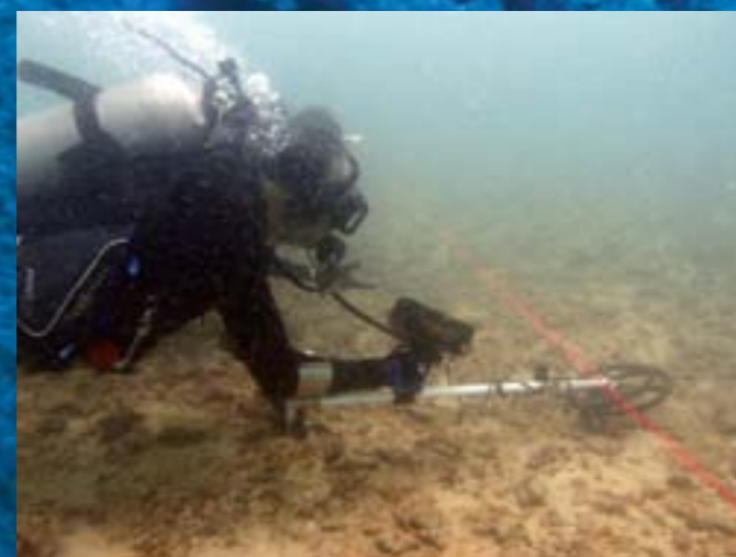
Use of a metal detector by a diver in Panama, © X. Nieto/UNESCO.

“With metal detectors it is like with poison and medicine, in the hands of the wise they are a gift, in the hands of treasure-hunters they are a threat.”