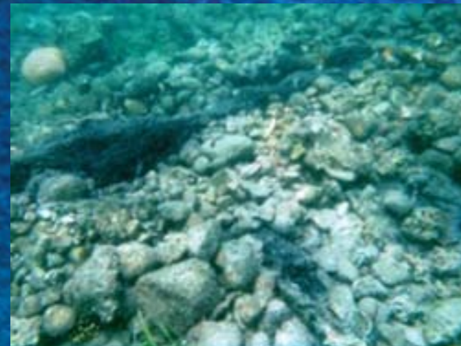
Mozambique – site exposed by treasure hunters