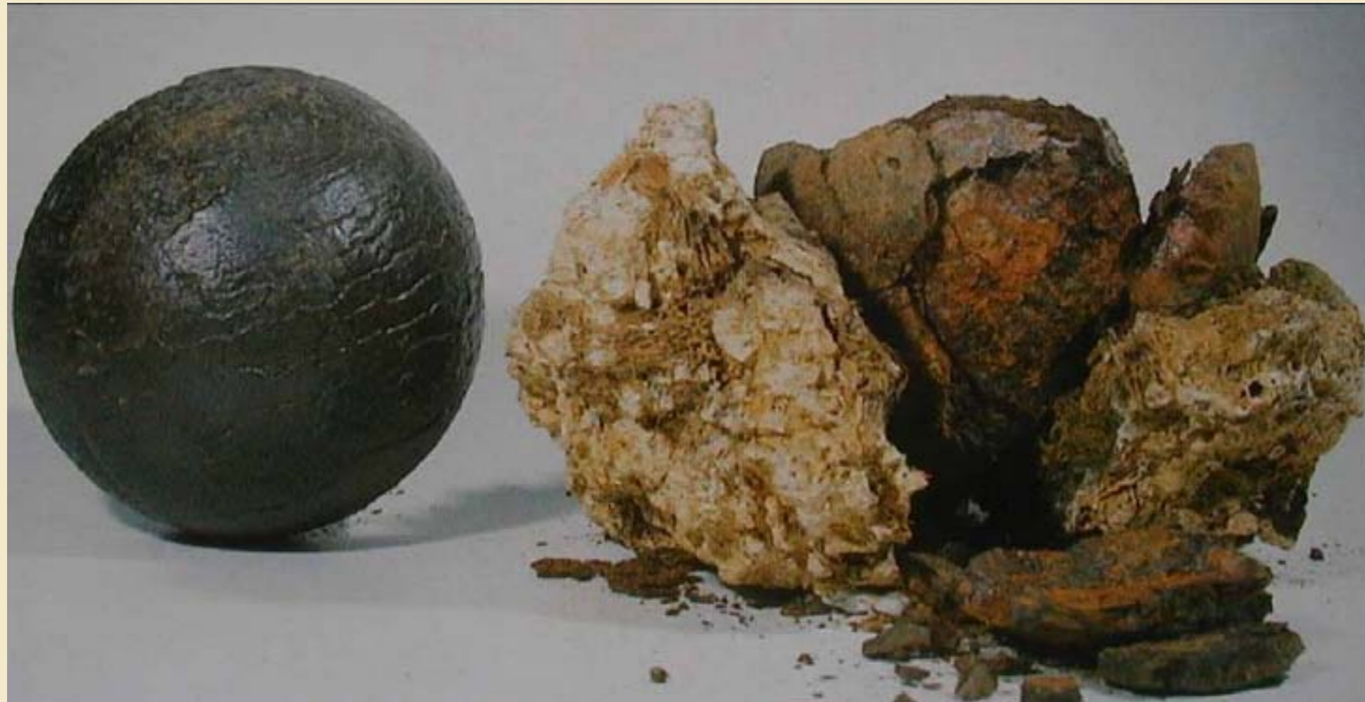
On the right an unconserved cannonball taken by looters from the Mary Rose, United Kingdom. On the left a cannonball from the same wreck, but which has been treated scientifically

Treasure-hunting companies often prioritize the quick removal of sediment to unveil sellable artefacts. A mission by the UNESCO Scientific and Technical Advisory Body (STAB) of the 2001 Convention to the San José site in Panama found that the treasure hunters employed powerful water jets using propeller deflectors to remove sediment, causing considerable damage to both the heritage value of the site and its natural environment.