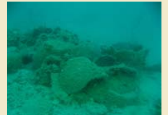
The Belitung wreck site in Asia. It was the only known Arab Dhow from the 9th century ever found. It was destroyed by commercial treasure hunters.