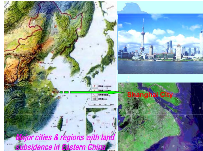
Major cities & regions with land subsidence in Eastern China