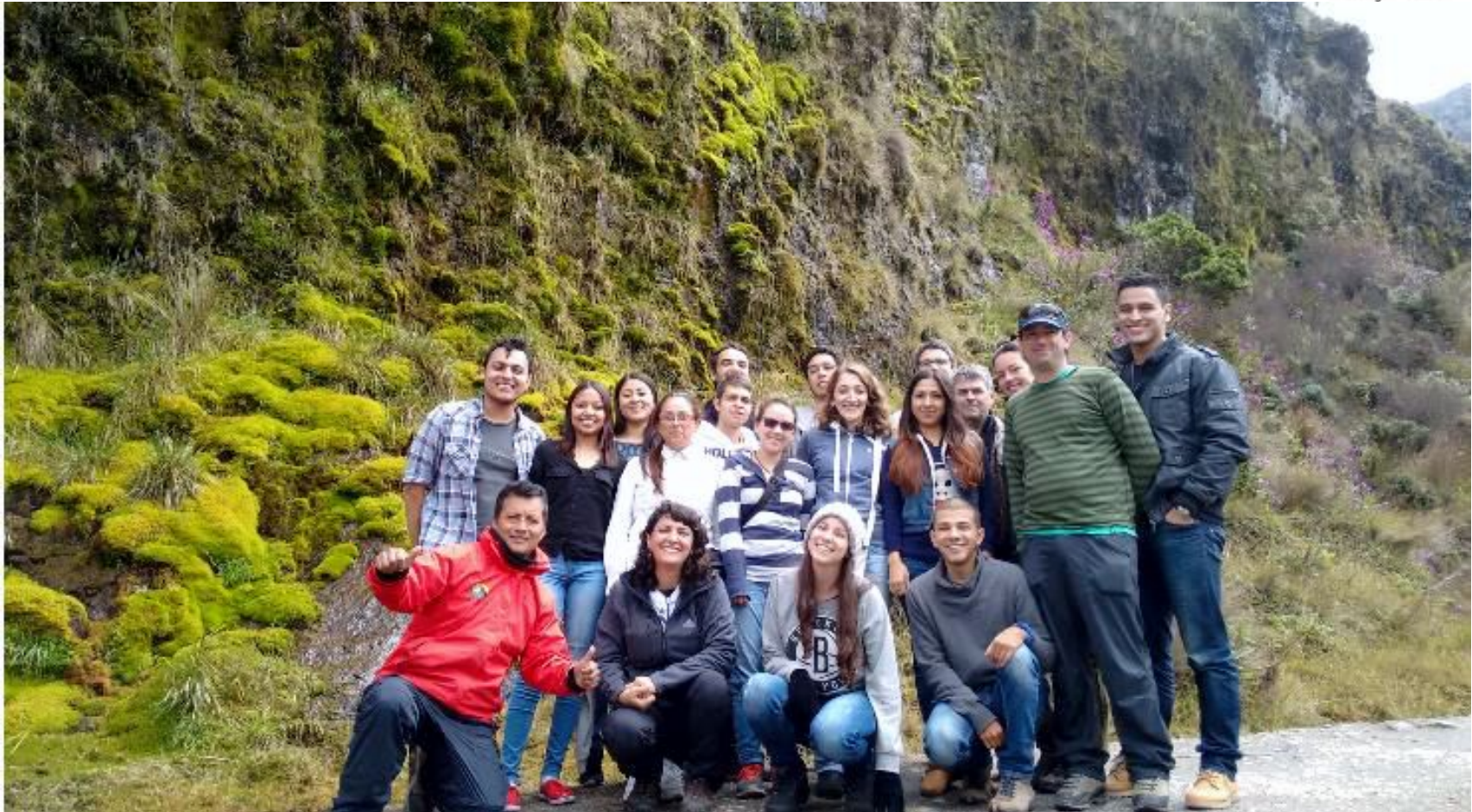
IGCP 636 Meeting – Los Nevados National Park (Colombia)