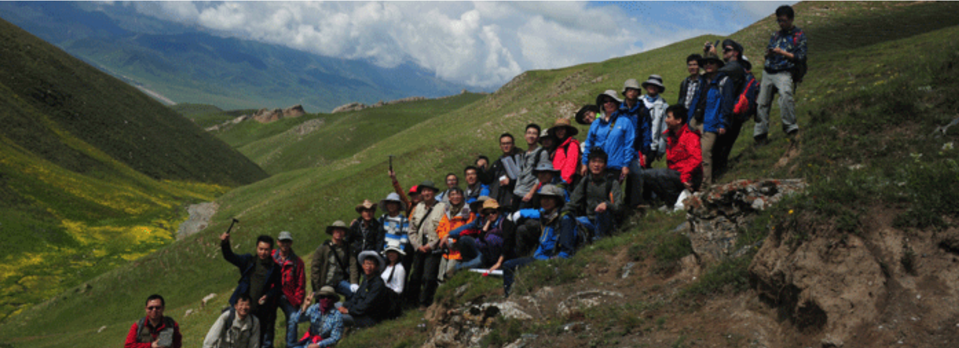
IGCP 649 Meeting – Qilian

5. International Geoscience Program (IGCP) field training exchange project