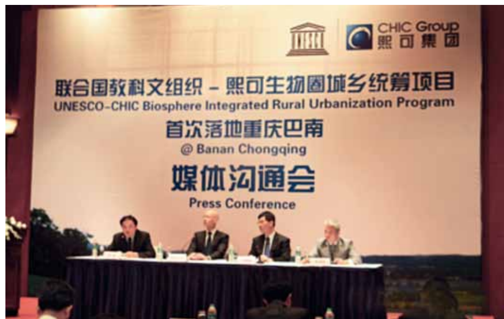
Press conference of launching the BIRUP programme in Chongqing, China on July 29, 2012

These projects all contribute to the goal of achieving a better link between the financial capital and high investment of expanding urban areas and the natural capital and ecosystem services of rural areas (Fig. 3). Alongside increased, yet sustainable, use of ecosystem goods and services to support rural and urban populations alike, will be a higher level of education and understanding of how the land and its natural endowments, forests, water and soils, can be used wisely and sustainably in order to provides the needs of both present and future generations.