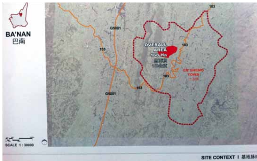
Fig. 2 – The first BIRUP site in Ba’nan District, Chongqing