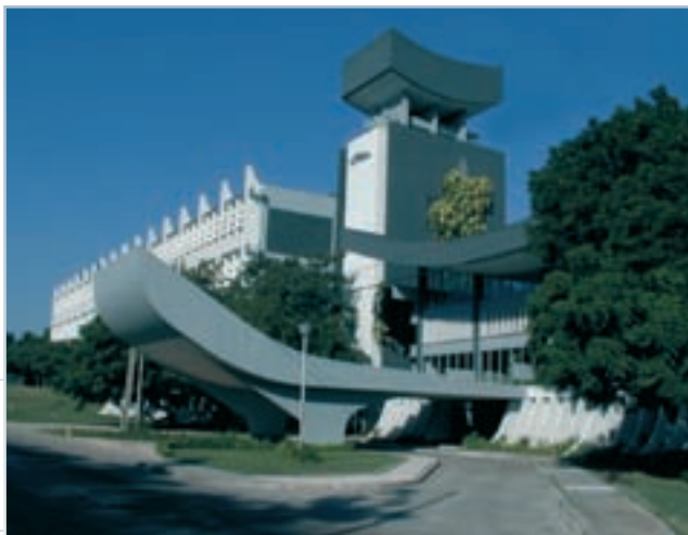
The Cuban National Centre for Scientific Research (CENIC), founded in 1964

Measures were then put in place to create new institutions and train a critical mass of scientists. The Cuban Academy of Sciences (founded in 1861) was reorganized in 1961, 13 institutes were created within the Ministry of Health and the National Centre for Scientific Research (CENIC) was founded in 1964. CENIC's initial role was to train and prepare scientists to staff a number of research institutes still on the drawing board at the time, of which the most internationally renowned is the Centre for Genetic Engineering and Biotechnology (CIGB), founded in 1986.