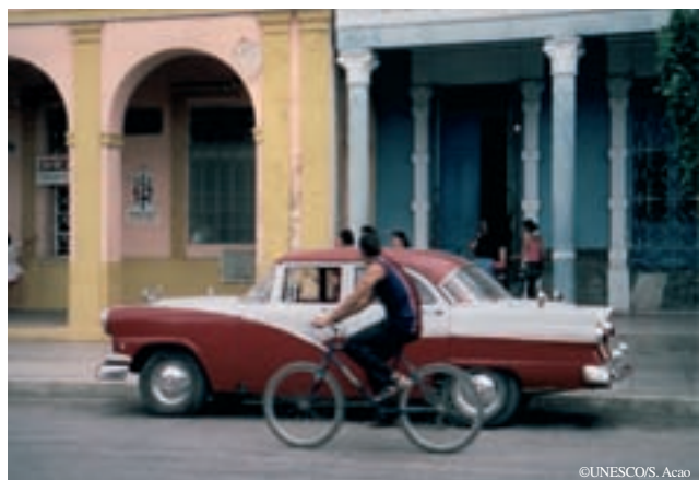
Street scene in Garagüey

At the Institute of Basic Research in Tropical Agriculture, I was somewhat surprised by the amount of research being done on neem 10 to create a natural pesticide. Neem culture got under way in 1991; by 2000, there were over 500 000 neem trees in Cuba. There is a joint proposal with the Caribbean Agriculture and Research Development Institute (CARDI) to produce the technology for the agro-industrial exploitation of the neem tree to obtain pesticides and veterinary products. In point of fact, the proposal goes further, suggesting a pilot programme in St Kitts & Nevis for the production and marketing of the neem pesticides.