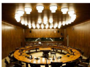
Room VII (-1 level)