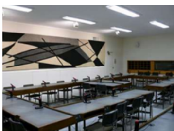
Room VI (-1 level)