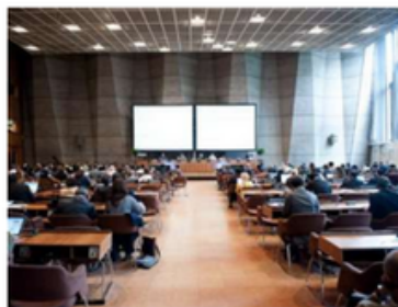
Room II (Ground)