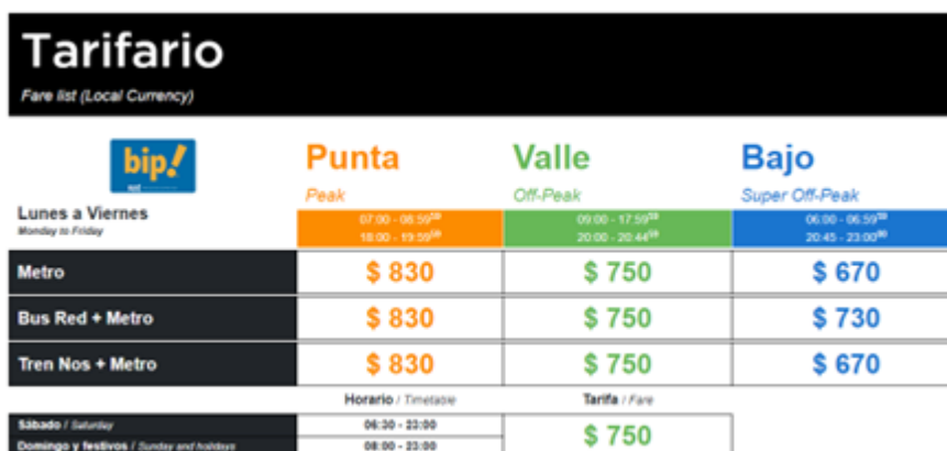
Public transportation fare list in local currency of Metropolitan Region.

The fare for public transportation varies based on the time of use. See below for details.